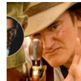
Anthony LaPaglia Exited 'Django Unchained,' Says Production Was "Out Of Control"