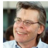
The Essentials: 5 Great Films Based On Stephen King Novels