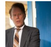
A Missing Dog Can Save America & Tom Waits Owns A Rabbit In New Viral Ad & Clips From 'Seven Psychopaths'