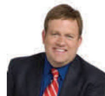
Dr. Frank I. Luntz Luntz Global LLC