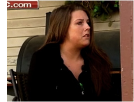
Teens set kid on fire for being 'white boy'