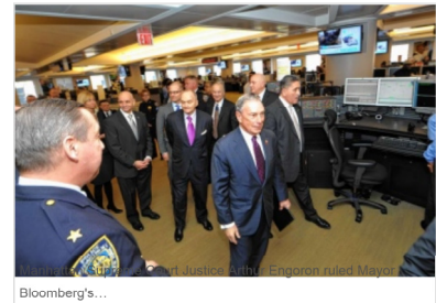
Bloomberg's... at Justice Court. Engoron ruled Mayor