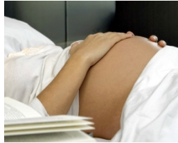
10-year-old gives birth to baby boy